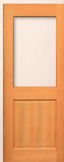
GNL - 37G