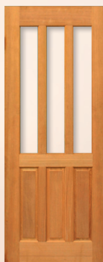
GNL - 70G