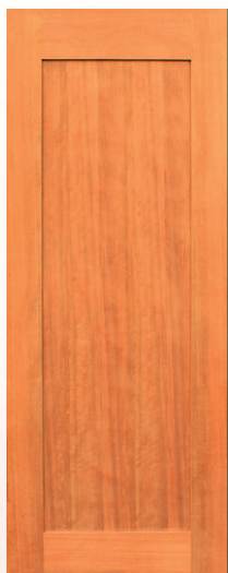
GNL - 1F(Ply)

Our newly improved Engineered Doors are manufactured with superior technology and methods, giving them resistance against shrinking, splitting and uneven colour.