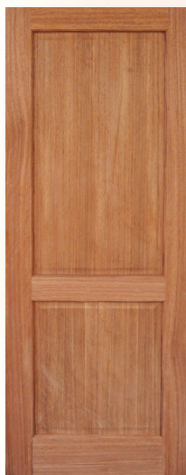
GNL - 02