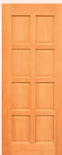
GNL - 20