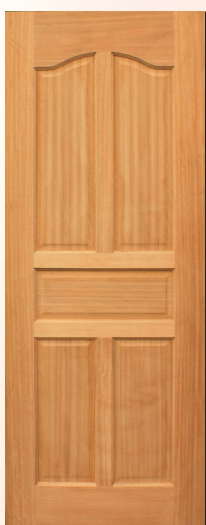
GNL - 30