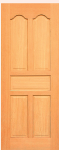
GNL - 10