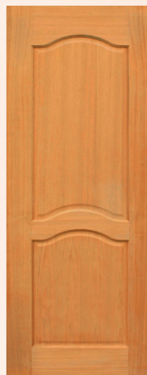
GNL - 228