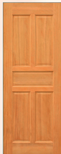
GNL - 15