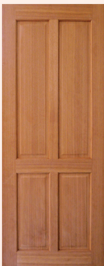
GNL - 04